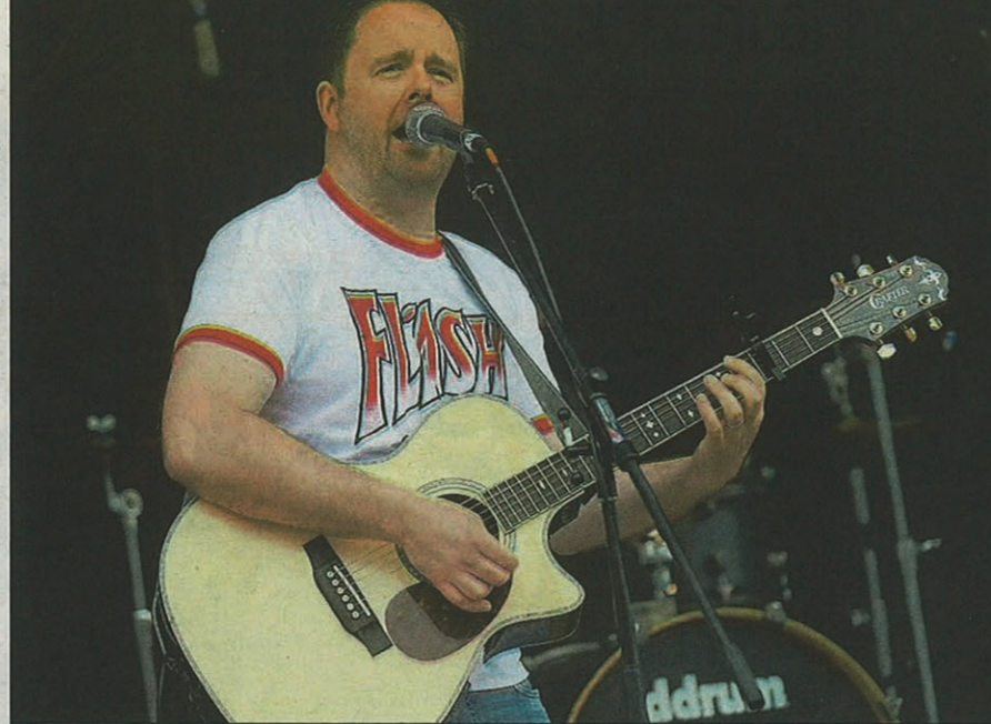
MUSICAL FEAST: There was a bumper turnout for the LeeStock Festival despite bad weather